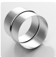
Hose connector Sheet steel connector for extending, connecting and joining light to medium-weight hoses