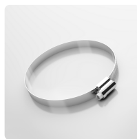
Hose Clamp with Worm-Gear Standard clamp for fastening light hose types to connecting pieces on mobile and stationary installations