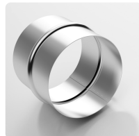
Hose connector Sheet steel connector for extending, connecting and joining light to medium-weight hoses