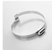
Master-Grip Hose Clamp, screwable Special clamp for fastening light and medium-weight, right-handed spiral hoses such as Flamex B-se, Flamex B-F se, Master-PUR Trivolution, Master-PVC and Master-SANTO