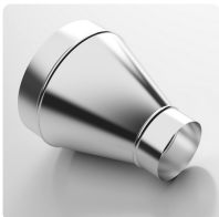
Hose Reducer, symmetrical Hose reducer for extending, connecting and joining light to medium weight hoses