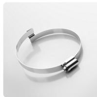
Clip-Grip Hose Clamp, screwable Screwable clamp for attaching all hose types from the Master-Clip series to mobile and stationary systems