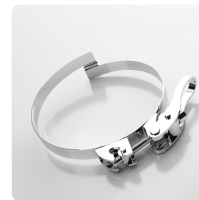
Clip-Grip Quick-Fix Clamp Special clamp for attaching all hose types from the Master-Clip series to mobile and stationary units.